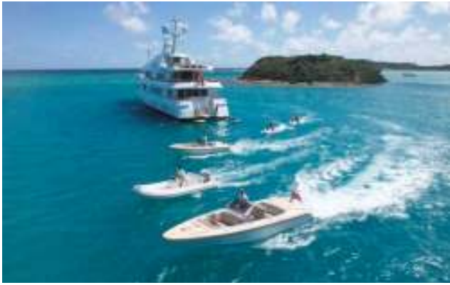
Tenders and Toys