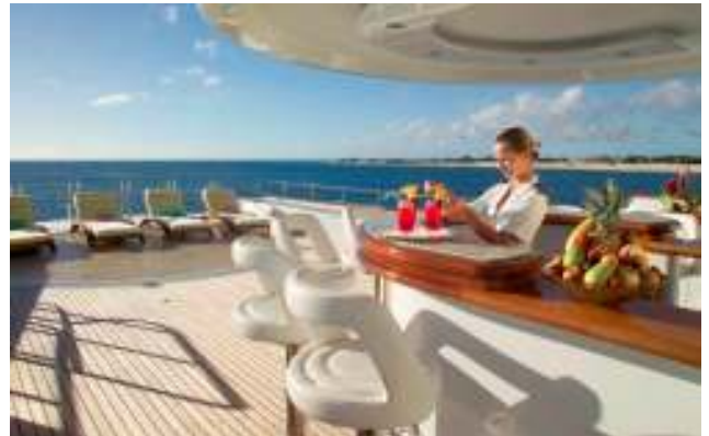
Sun Deck Bar