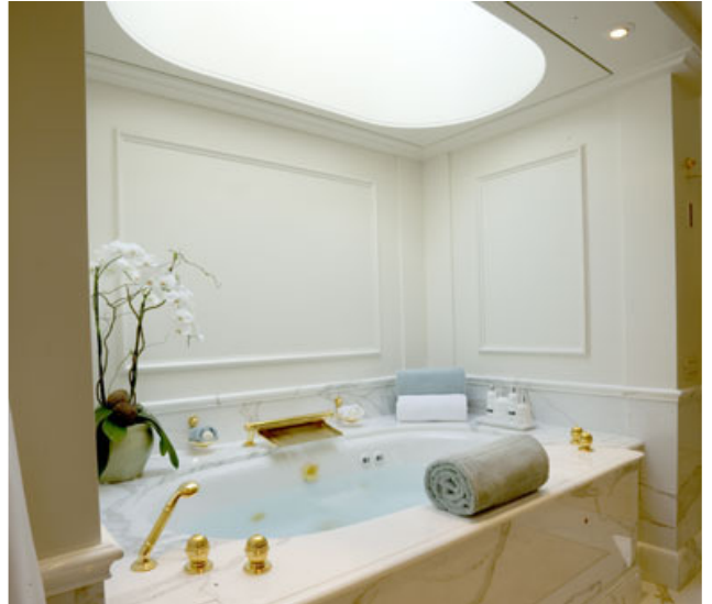
UTOPIA Master Bathroom