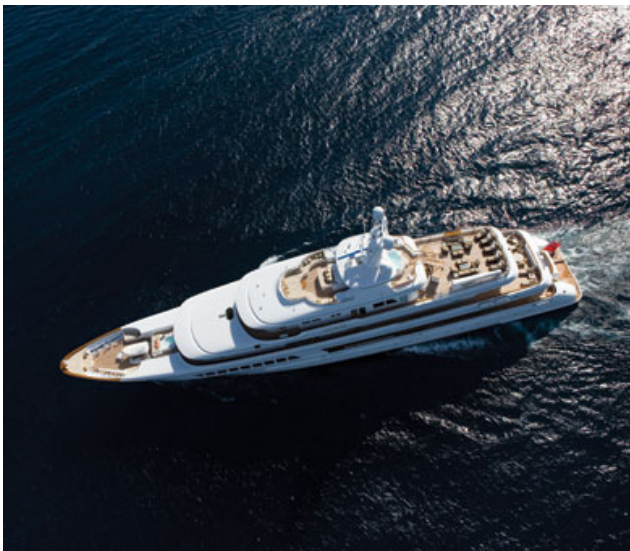
UTOPIA Aerial view

UTOPIA is subscribed to News Direct service -a large selection of papers printed on demand