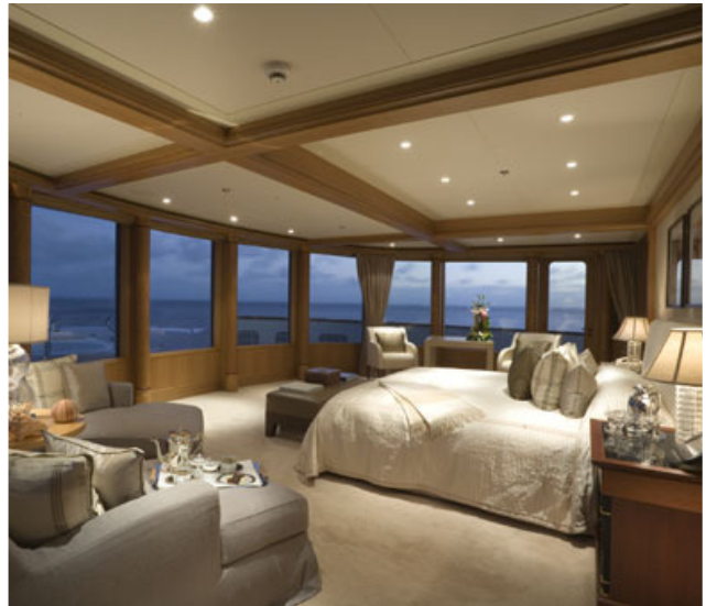
UTOPIA Master Suite