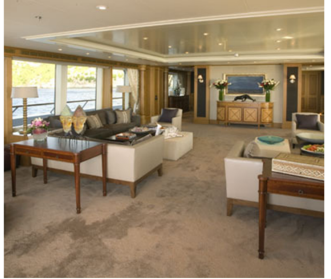
UTOPIA Main Saloon