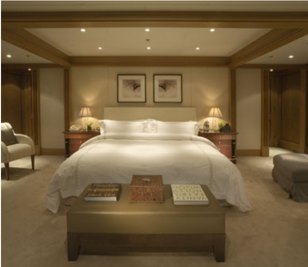
UTOPIA Master Suite*