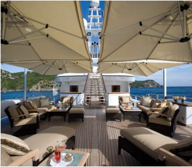
UTOPIA Outside Seating Area