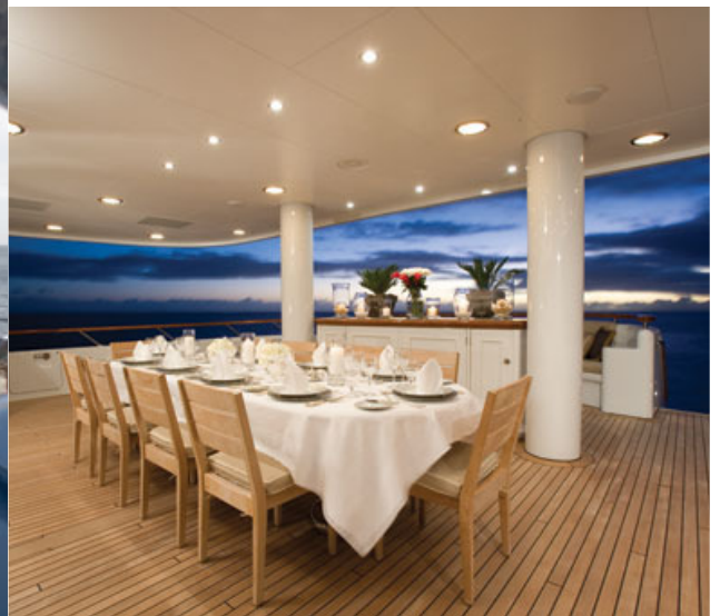
UTOPIA Alfresco Dining