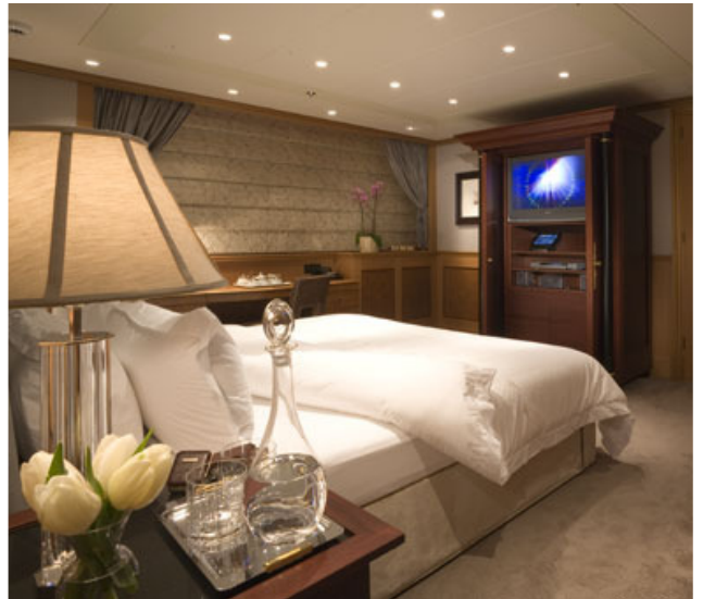
UTOPIA Vip Suite