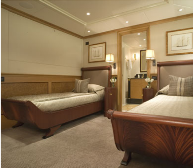
UTOPIA Guest Twin Cabin