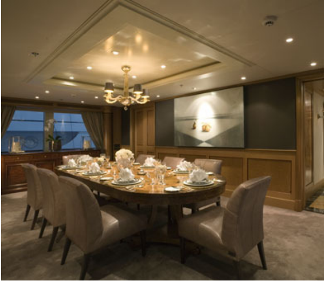
UTOPIA Formal Dining