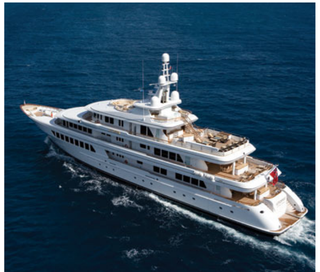
UTOPIA Aerial Aft View